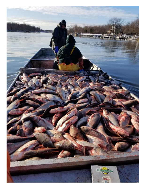
Figure 1. Silver carp catch from 200 yards of gill net at Bull's Island side channel in the Illinois River near Ottawa during December.